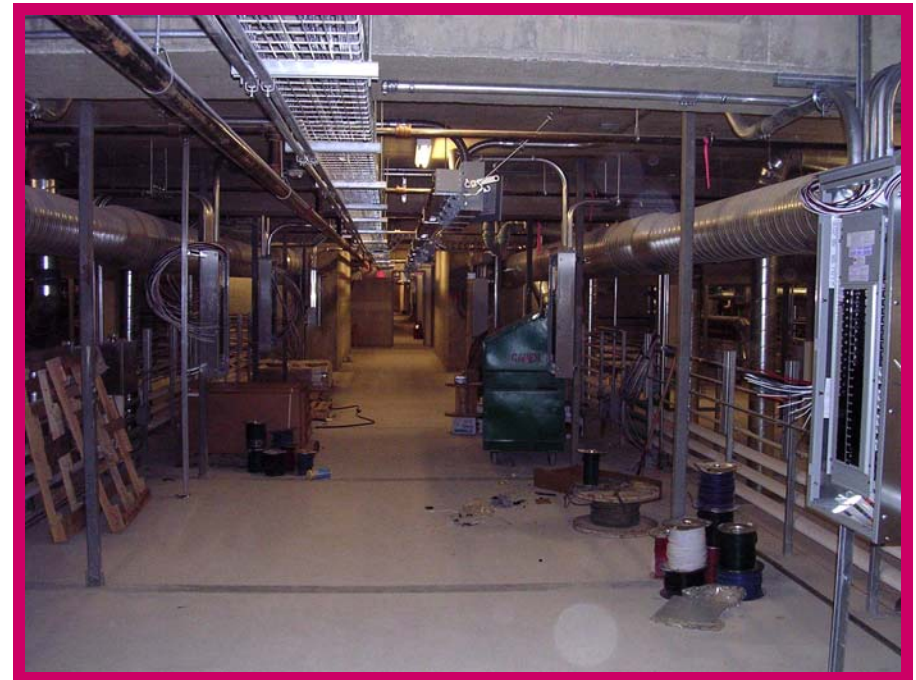
Interstitial space immediately above the Libin floor – water, air, gas, electricity. Amazingly, the visible square-footage of every lab is actually only 50% of the square-footage it requires. Before you ask, no, we cannot use this space for offices ☹